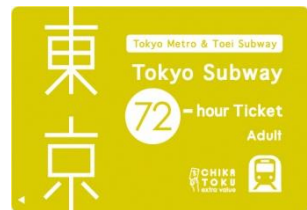
Tokyo Subway Ticket (Image)

From left: 24 hours, 48 hours and 72 hours (All adult tickets)