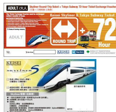
Left Photograph: Keisei Skyliner