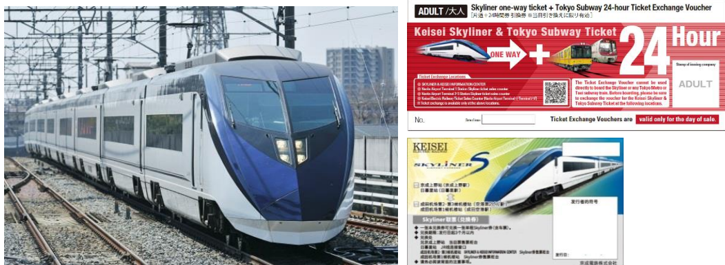
Left Photograph: Keisei Skyliner

The details of the expanded network of sales outlets of the “Skyliner Coupon” and “Keisei Skyliner & Tokyo Subway Ticket” are on the next page.